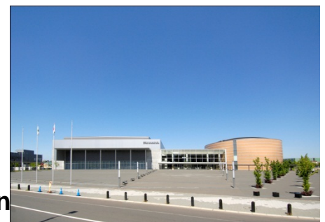
SAPPORO CONVENTION CENTER